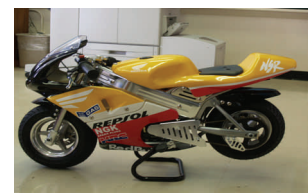
Second Prize Repsol Pocketbike (mini bike with gas engine) Donated by Gingerbread Racing Retail value $399.00

Please call the office to get tickets to buy or to sell. (780-466-2265)