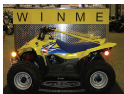
First Prize Suzuki QuadSport Z50 (mini quad) Donated by Alberta Cycle Retail value $2649

Tickets were on sale starting April 28, 2007 and the Prize Draw will be at the CF Office on November 30, 2007. No cash alternative for prizes. If either of the winners cannot be located within 15 days, a second name will be drawn. Tickets are $4 or three for $10. Raffle License #250745