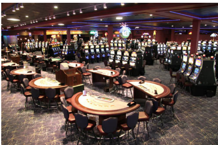
Century Casino floor

The chapter expects to receive approximately $70,000 from the casino and the money raised will go directly toward cystic fibrosis research taking place in Alberta.