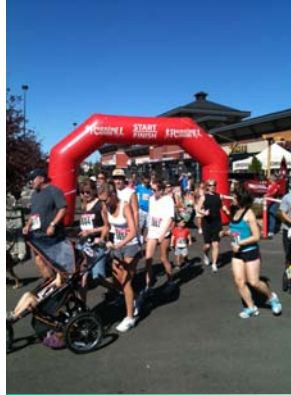
Runners Set Off